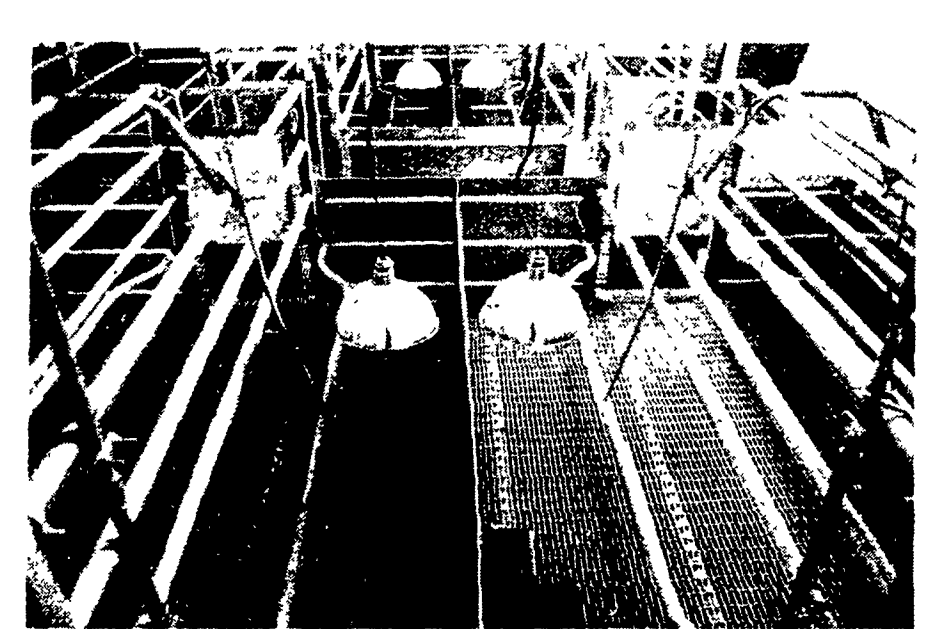
Total Woven Wire Flooring In Farrowing Rooms (Narrow European-Style Crates) Fristamat Ventilation And Lissco Manure Handling