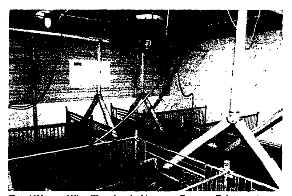
Total Woven Wire Flooring In Nursery Rooms, Fristamat Ventilation And Lissco Manure Handling

-For An Appointment, Call Farmer Boy Ag Anytime