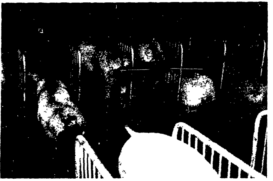
Tethering In Gestation With Concrete Slats, Fristamat Ventilation, And Lissco Manure Handling.