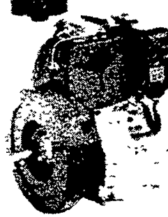
The Water Pump Diesel