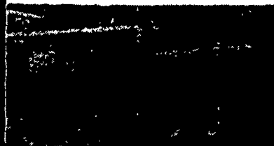
HUSKY FRONT MOUNT SOIL INJECTORS