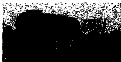
LIQUID TANK SPREADERS 6 sizes to choose from 1200 gal. to 5000 gal.

ALL EQUIPMENT IN STOCK READY FOR DELIVERY We Need Good Used Liquid Manure Equipment