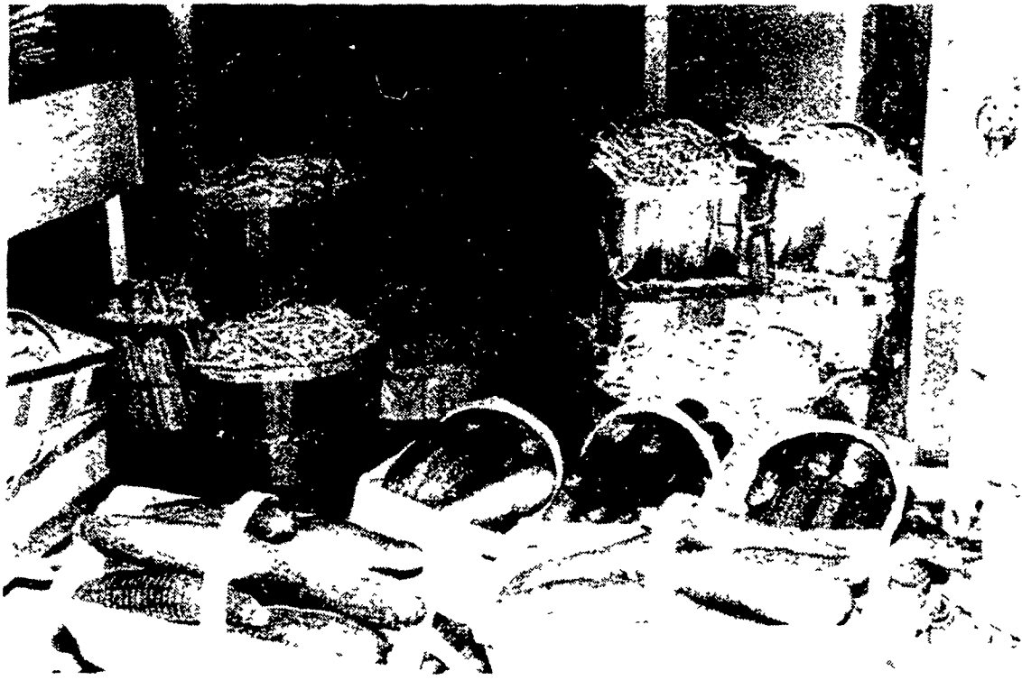
Many products can be found in the large walk-in cooler near the Elbel home. Ready for retail sale at Farmer's Markets, trucks parked in nearby towns, or direct from the farm are... beans... and zucchini... and squash.

Irrigation is used more often for frost control on this farm than for water purposes. There are three ponds on the Elbel farm and four irrigation pumps. "You must have a spare pump. It is possible for