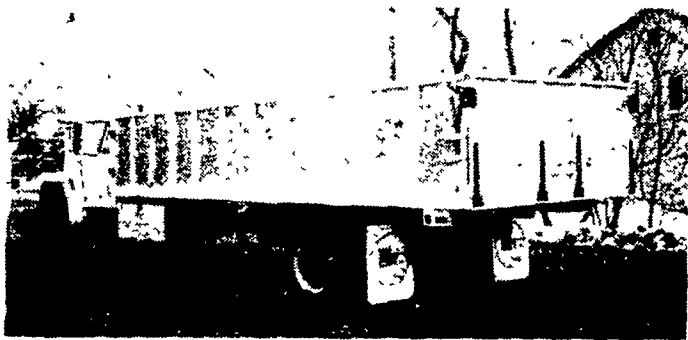
Aluminum Grain Body

Manufacturer of ALL ALUMINUM TRUCK BODIES Livestock, Grain and Bulk Feed