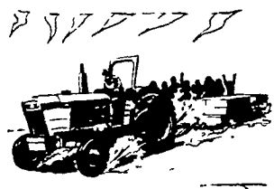
TRACTOR PULLING CONTEST

Senior Citizens, Free Admission with I.D. Cards