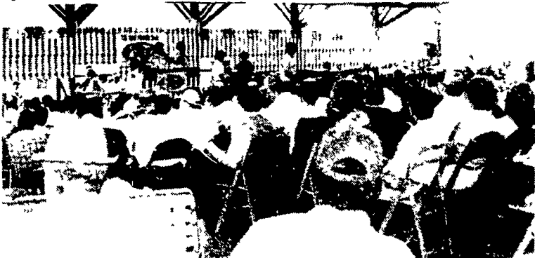
Buyers representing seven states bidded their way to a sale total of $205,550 at Wednesday's Sire Power Sale in Kutztown.