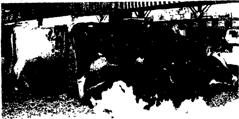
Waiting their turn to enter the sale ring were 67 of the top Holsteins bred by outstanding Sire Power bulls.