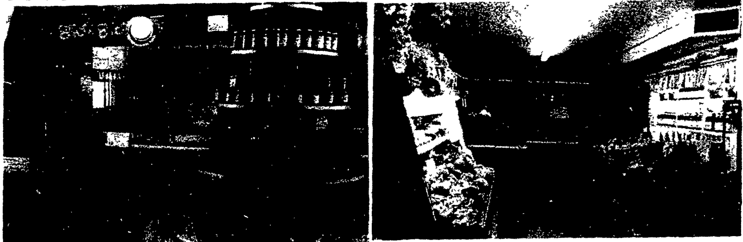
The roadside market offers the customer a diverse selection of fruits, vegetables, preserves and fresh baked goods.