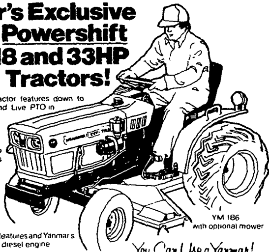
You Can Use a Yanmar!

Plus more standard features and Yanmar's dependable 3-cylinder diesel engine.