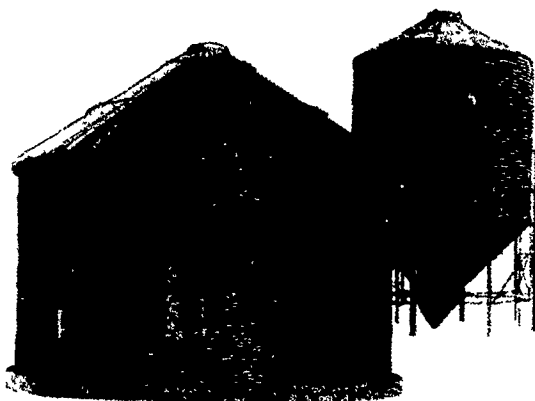
Select from over 100 models of dual purpose bins (for storing & drying) and hopper bottom models for holding — plus over 200 commercial models.

Get full facts about all BROCK's features — for convenience, safety, and long bin life. Contact us. Find out for yourself WHY YOU SHOULD CONSIDER BROCK FIRST.