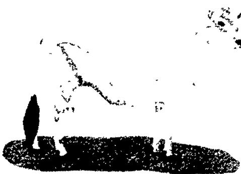
Handsome quilt featuring the ideal Jersey cow sold for $300 at the July 4 Cumberland Valley Jersey Breeders sale.