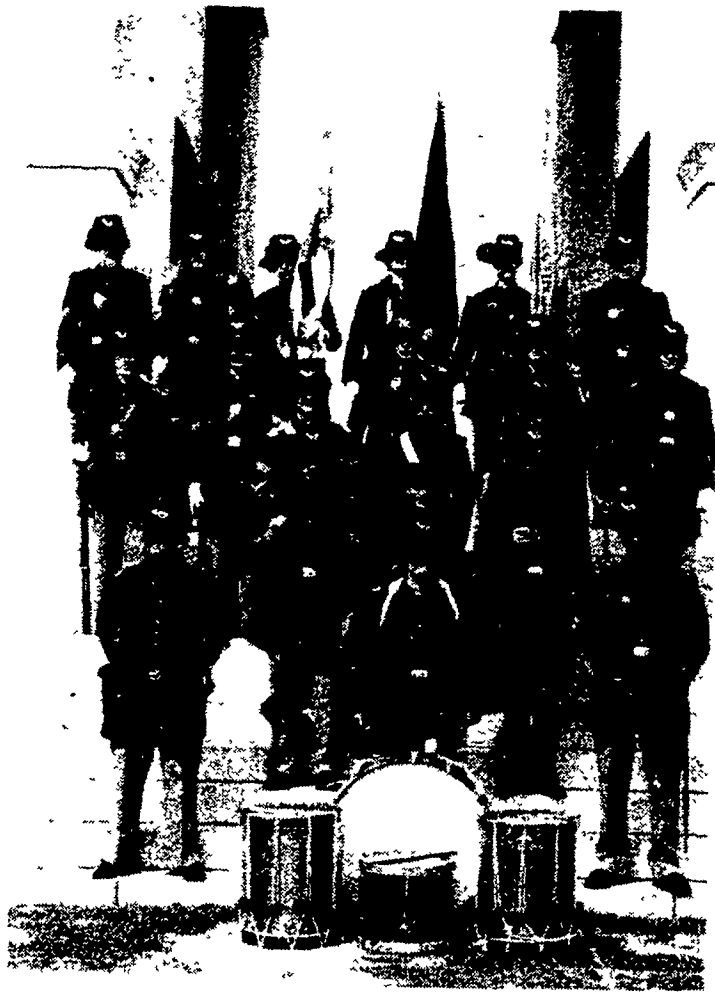
The Lancaster Fencibles