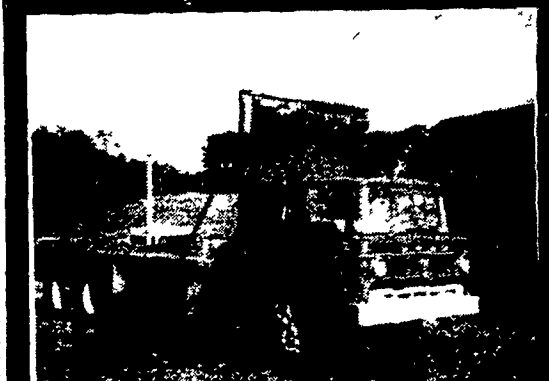
1971 CT805, 391 Gas, 41,000 GVW, 28' Bed, Unit Is In Good Cond. 717-367-1545

WANTED TO BUY Good used cattle body, steel or wood, 14' 717-949-3439 or 949-2448