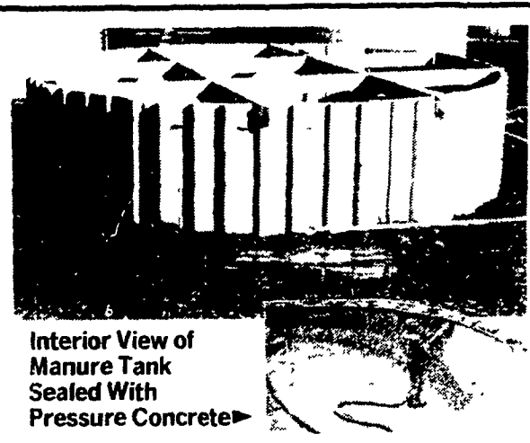
Interior View of Manure Tank Sealed With Pressure Concrete

REPAIRING STONE WALLS with SPRAYED ON PRESSURE CONCRETE