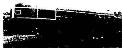
7x18 Gooseneck Stock Trailer