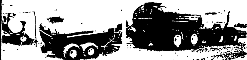
HUSKY FRONT MOUNT SOIL INJECTORS