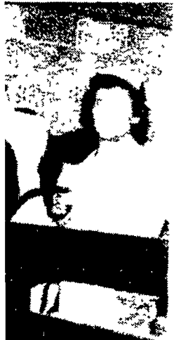
with Petro in their