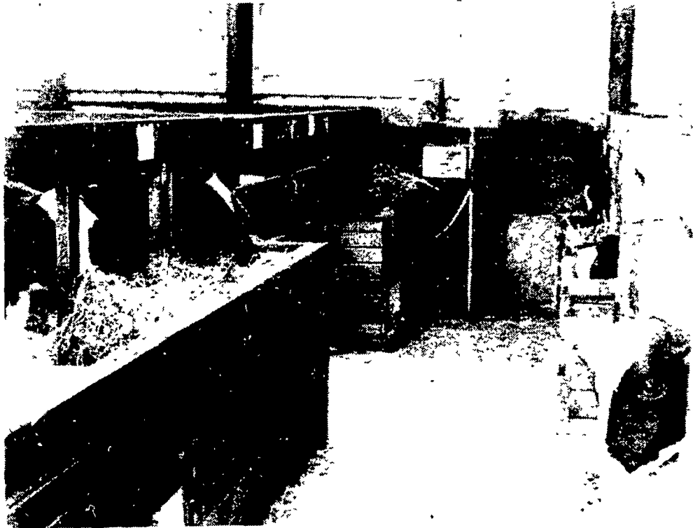
Interior of the "barn that Petro built" includes enclosed calf section with individual stalls and group heifer pens.