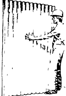
6'7" x 46" Sheet