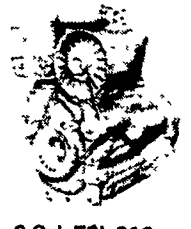
2 Cyl. F2L-912

FOR PROMPT SERVICE CALL 717-354-4158 OR IF NO ANSWER CALL 717-354-4374