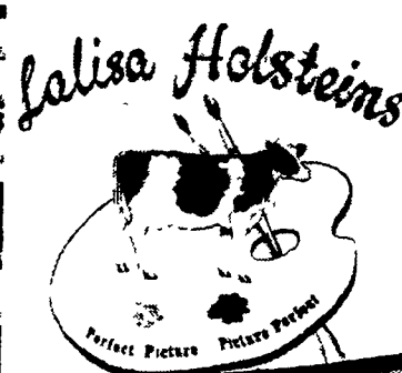
Holstein artist B18