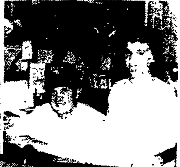
Queens Manor A20-21