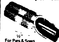
For Pigs & Sows

LOW-COST, Trouble free Nipple Drinkers! Easy to clean, Easy to change