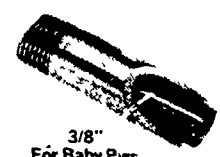
For Baby Pigs