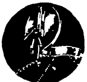
WEATHER TIGHT GROUND CONNECTION WITH TROLLED ROOF HATCH (SLAM DARD)

...VALUE PACKED FEATURES make this the bin you'll want