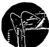
LEAF HANDLE RAIL (optional)