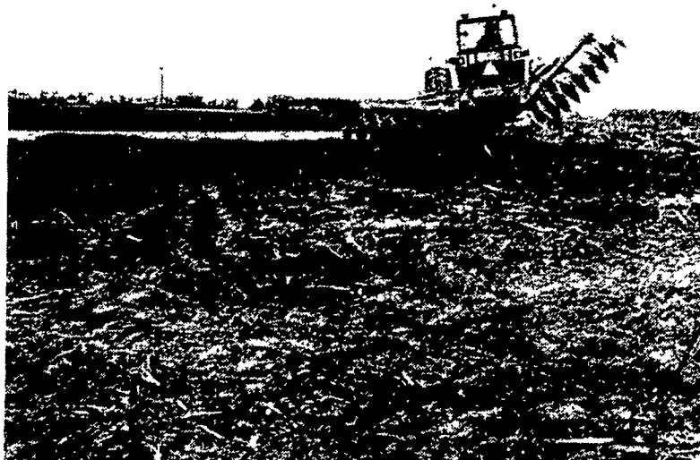
Terrace plow aids conservation practices.

The terrace plow demonstration will be in operation from 10 a.m. until 2 p.m. The demonstrations is sponsored by the Montgomery County Conservation District and Hamilton Equipment of Ephrata. The USDA Soil Conservation Service (SCS) will be supervising construction. Further information can be obtained by calling SCS at 215-279-1178 between 7 a.m. and 5:30 p.m., Monday through Friday.