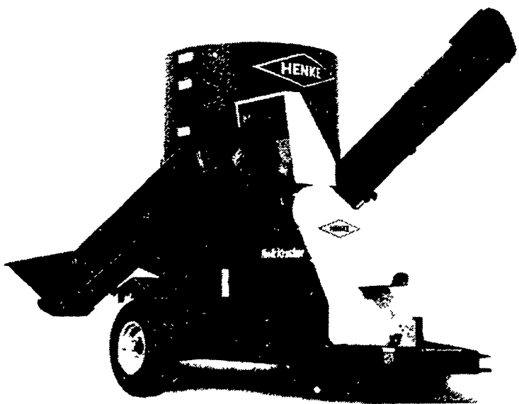
Henke Machine, Inc.'s Portable Mixer with Ear Corn Mill, Model 24, can crush and roll wet or dry ear corn, mix it with supplements and auger fresh feed into feedbunks, feeders or bins.