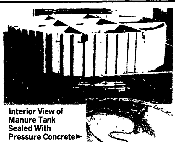
Interior View of Manure Tank Sealed With Pressure Concrete