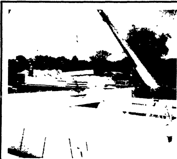
PRE-CAST CONCRETE CATTLE SLATS

Available In: • 4 Ft. Widths • 8, 10 & 12 Ft. Length Sections ASCS Approved