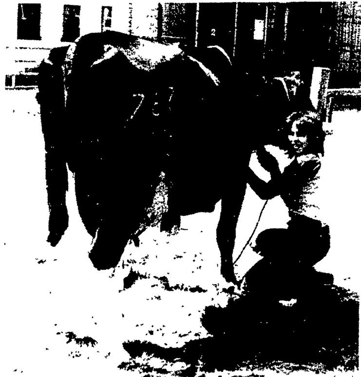
A startled exhibitor was one of many vying for a spot to tie to while clipping.