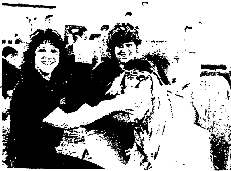
This little fellow won the Calf Dressing Contest as a scarecrow.