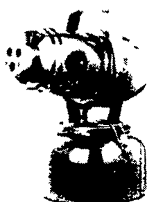
Tri Jet Fogger

Selection of Dust Bags And Refills In Stock