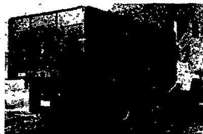
SOLID OR VENTED GRAIN SIDES UP TO 82" HIGH. Inside dimensions range from 9 to 24 feet long, 90" wide. Choose standard 42" or 52" die-formed steel sides, add optional 12" solid topper panels to increase bushel capacity up to 28 per cent

Reading Body Works, Inc., P.O. Box 14, Reading, PA 19603. 215-775-3301.