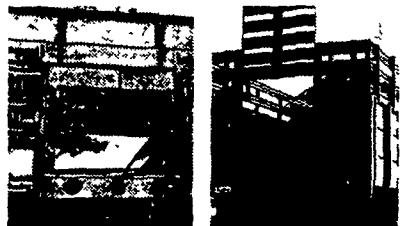
MULTIPLE GATE OPTIONS. Standard center grain metering gate opens full or half-oper. for fast, smooth grain flow. Full width rear vertical doors open for maximum unloading speed. All steel sliding livestock gate is pulley operated