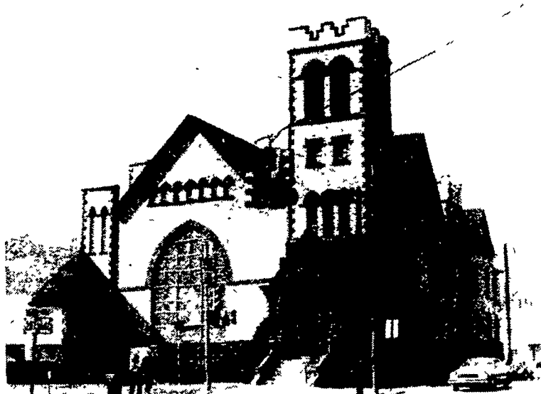
Across the street from the courthouse, this dignified, stone Episcopal Church beckons tourists to peer through its bright red doors.

But in spite of its age, the hotel is modern in every sense of the word. The rooms are spacious and comfortable, with closets that make you wish you could transplant them in your house. The bathrooms are clean, private, and well supplied. There's still one or two down the hall though if you want to look to see how the old time hotel guests had to wait their turn.