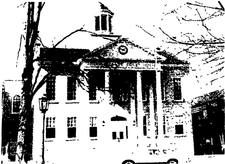
Lost in the hills of Tioga County is Wellsboro, the county seat. Here, the stately white courthouse, still in operation, stands as a reminder of yesteryear.

The trip itself is half the fun. It takes approximately four hours from the Lancaster area, where we came from. Above Harrisburg, on Routes 11/15 you travel beside the winding Susquehanna, visualizing the barges that traveled on the canal just beside your road.