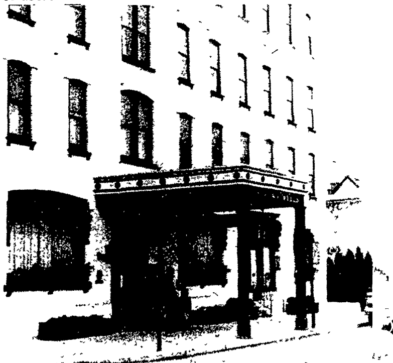
The Penn Wells Hotel, host for the weekend getaway, offers guests a step into the Victorian era with its red carpets and simple elegance.