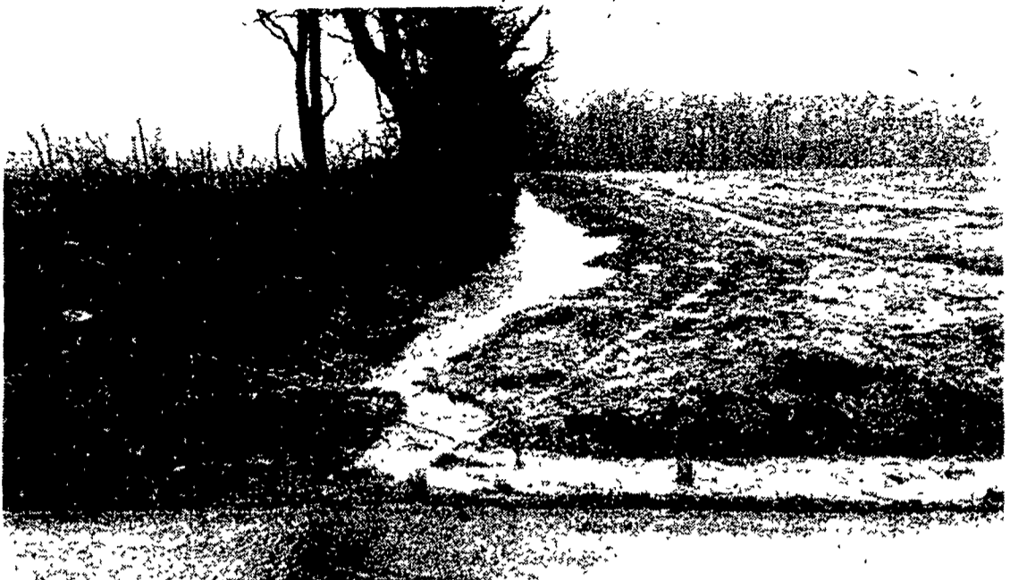
How much topsoil is being lost from this field? PIK-idled acres provide a good opportunity to install conservation practices.