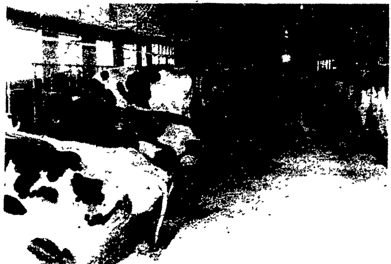
With 25 cows classified excellent, 19 good plus, and 65 very good, there is no room for slackers in the 97 tie stall barn.