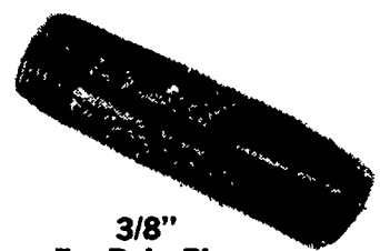
3/8" For Baby Pigs