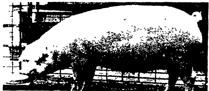
PSEUDORABIES FREE HERD #58 VALIDATED HERD #92 SALE TO BE HELD AT THE FARM RAIN OR SHINE

100 HEAD 35 BRED GILTS 30 OPEN GILTS READY TO BREED 20 OPEN GILTS 100-125 LB. 15 BOARS READY FOR SERVICE FREE LUNCH — 5:00 P.M. to 6:30 P.M.