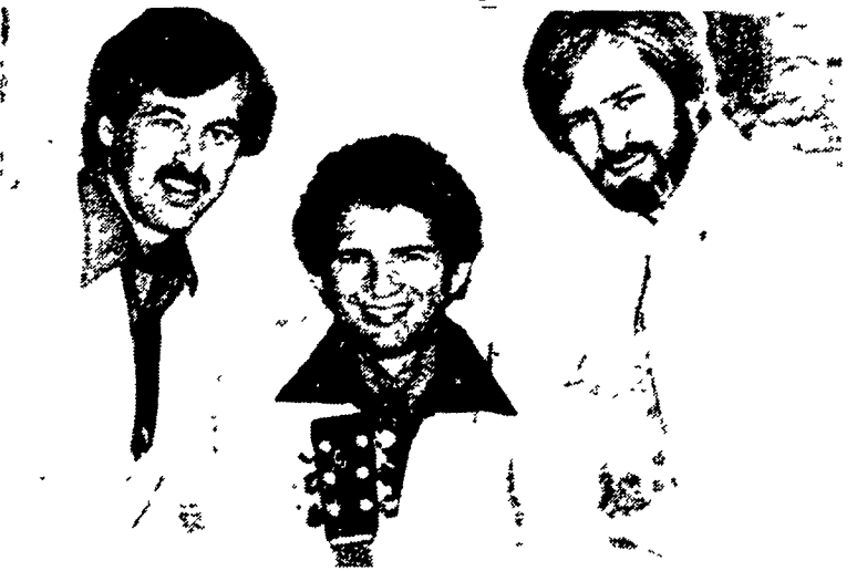
Three on a String will be the entertainment at Delmarva Poultry Industry Booster Banquet on April 26.

WEB SNYDER, INC. RD #1 Watsonstown, PA 717-538-5555