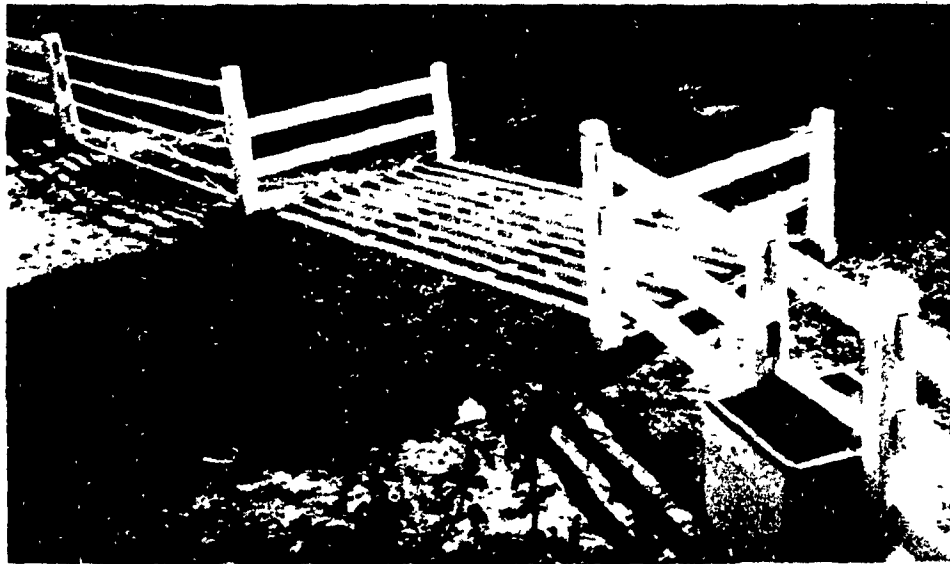
The Smith Cattleguard - No. 1 in the country. Save the time and energy of opening and closing gates.