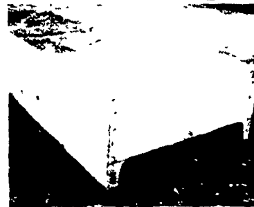
Centerline Feed Bunk - Adaptable to all types of overhead feeding systems