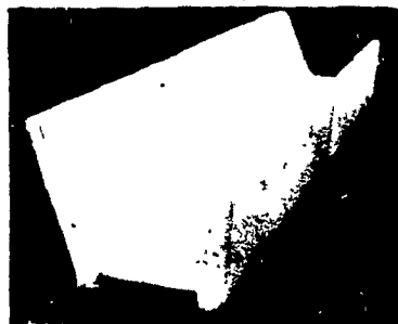
Fenceline Feed Bunk - Smooth surface, rounded corners for less waste