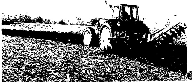
Conservation measures at reduced costs are applied to shale soils of Dauphin County with terrace plow.

LANCAST revolution in ground for 1 months the pesticides agriculture Soybean c at ag oil dealer ser promises t bicide appli herbicide c worldwide o to lower soy But there these pro mediately, in the Mar Digest, a r growers American Environment restrictions, and in-fight agricultural delaying so and use with Most univ