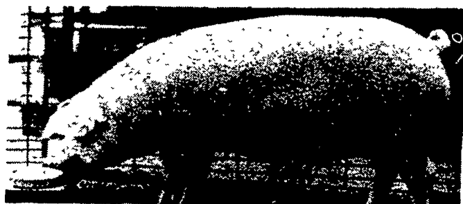
PSEUDORABIES FREE HERD #58 VALIDATED HERD #82 SALE TO BE HELD AT THE FARM RAIN OR SHINE

100 HEAD 35 BRED GILTS 30 OPEN GILTS READY TO BREED 20 OPEN GILTS 100-125 LB. 15 BOARS READY FOR SERVICE FREE LUNCH - 5:00 P.M. to 6:30 P.M.