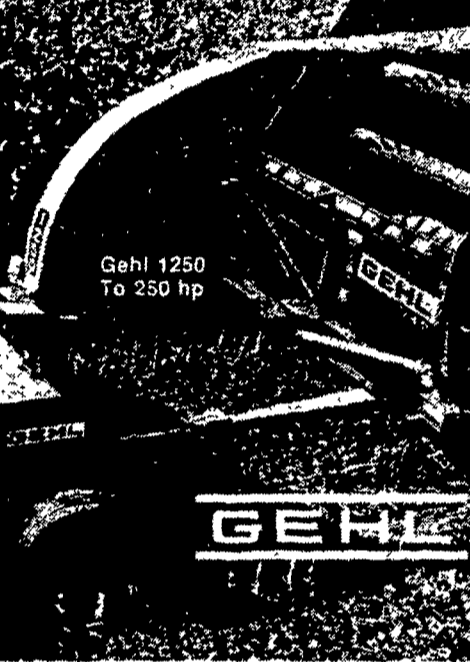
Gehl 1250 To 250 hp