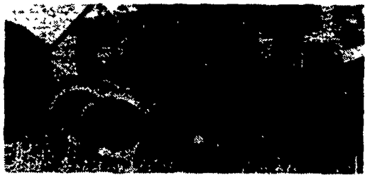
Choose single or dual packer wheels. Dual, V-shaped packer wheels "mold" the soil around the seed as if you were planting by hand. Helps prevent crusting. Wheels are easily adjusted for accurate depth control.

Positive Depth Control: Parallel linkage, dual pivot mounted runs provide positive depth control on all runs.