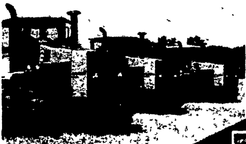
Model CP 1325

THE NEW STEIGER PANTHER 1000 With Power Shift Transmission