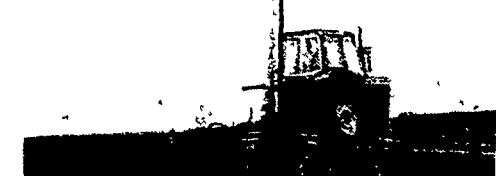
Model S-310W 310 Gallon Tank Capacity