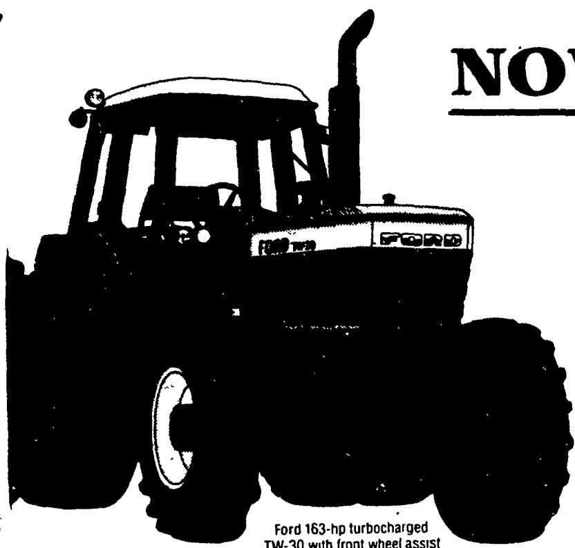
Ford 163-hp turbocharged TW-30 with front wheel assist