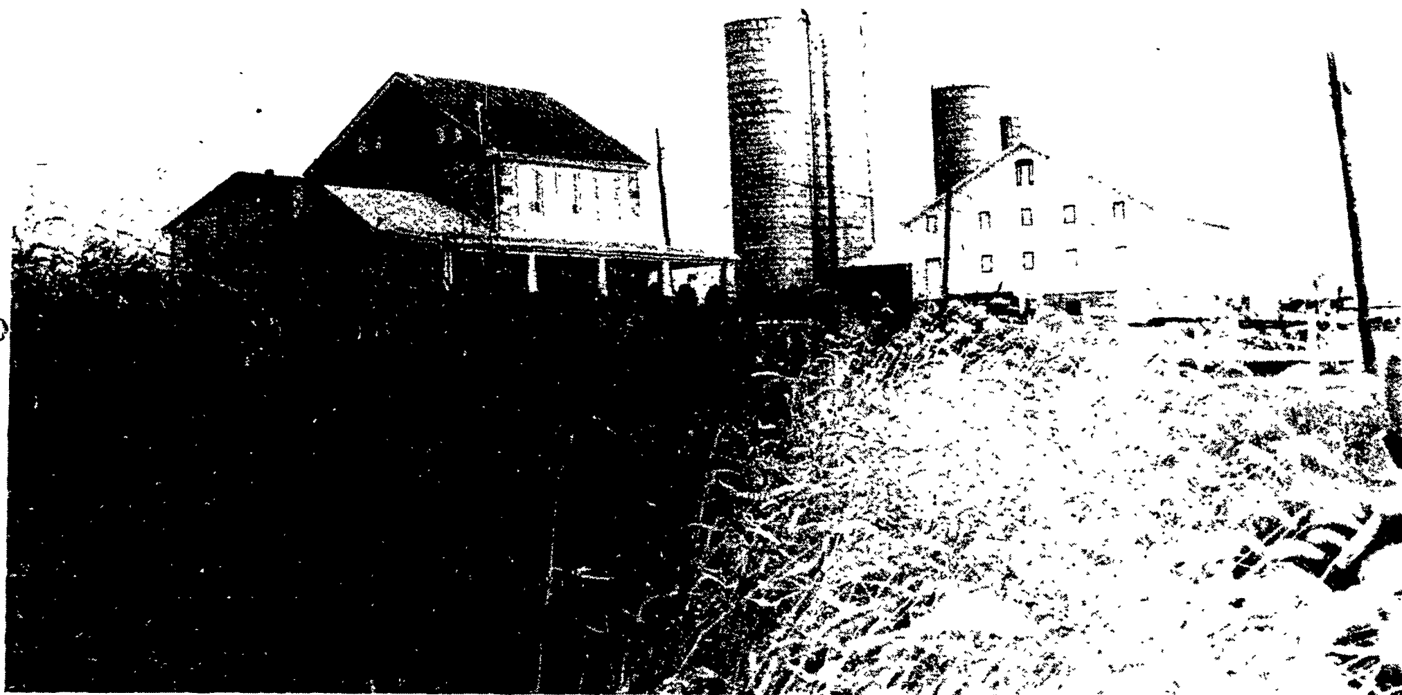
Montsera, Cumberland County