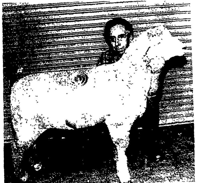
Mellott also captured reserve grand champion Corriedale ewe honors during the open breeding sheep show held Monday evening in the small arena.