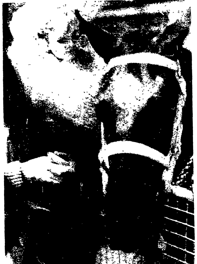
The mystique between little girls and horses is nurtured with this youngster's visit to Farm Show 1983.