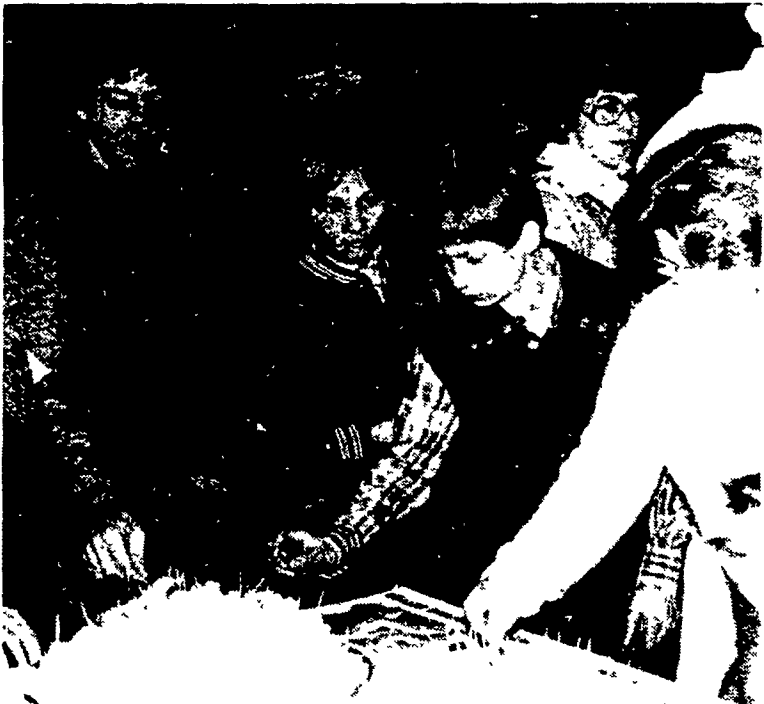
A group of opening day Farm Show visitors nibbles it's way through the large arena beginning with the state dairy princess' cheese booth.