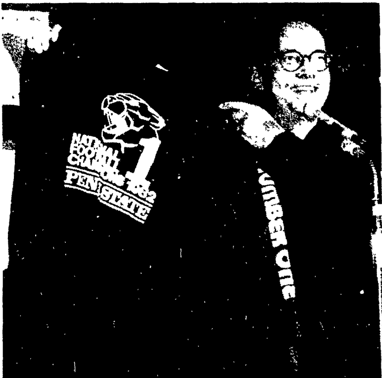
Make no mistake, the Nittany Lions are number one! This regal sweatshirt will find its way into the Governor's Mansion, thanks to the Penn State College of Agriculture.