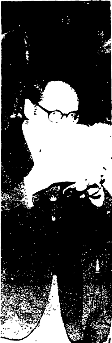
Saluting the "official" drink.