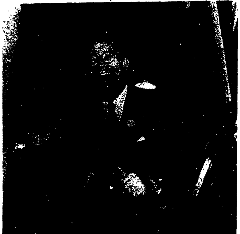
The Governor samples part of the $25 million of machinery displayed during Farm Show week with his annual "crawl into the cab."

The public participated in the festivities by filling the large arena and munched their way through the commodity stands which served up just about anything from soup to nuts. —DT.