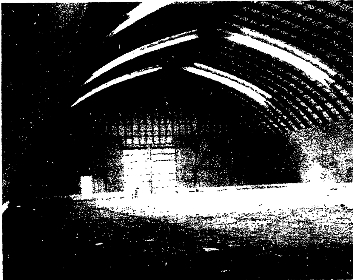
80' x 136' x 31', Cumberland Co.

PH: 717-786-2173 RD 3, Quarryville, Pa. 2 miles west of Georgetown on Furnace Road