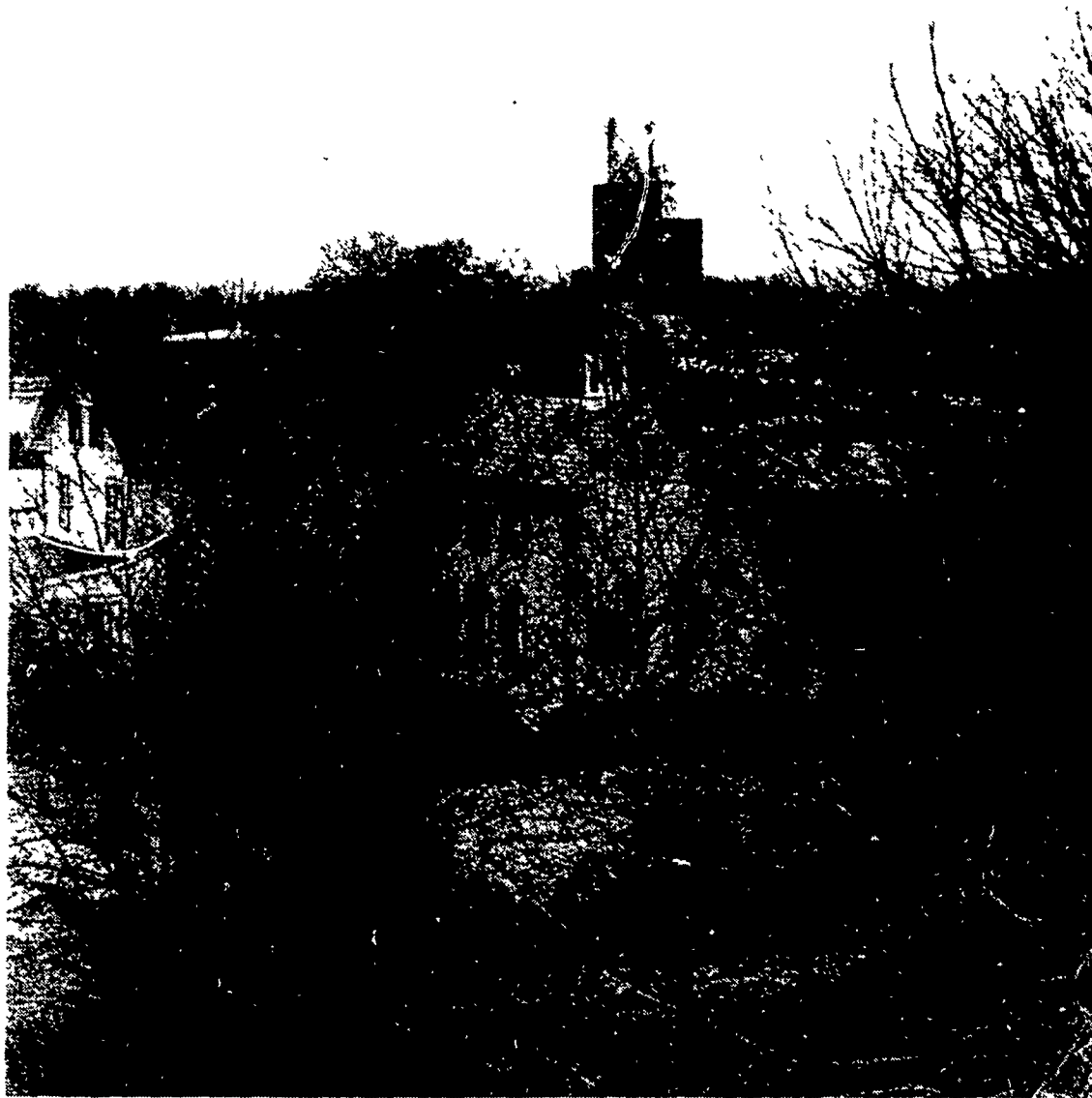
Large farm-type house in foreground with cupola bell-tower and Purina plant in background provide contrasting skyline elements west of Lancaster.