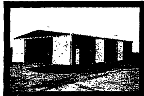
AG MASTER 2:12