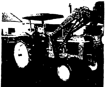
1978, 750 hrs., new cond.