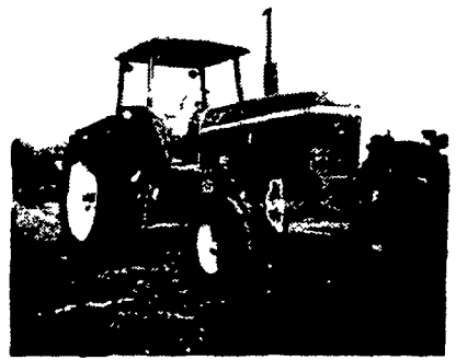
1977 model, 1300 hrs., very clean