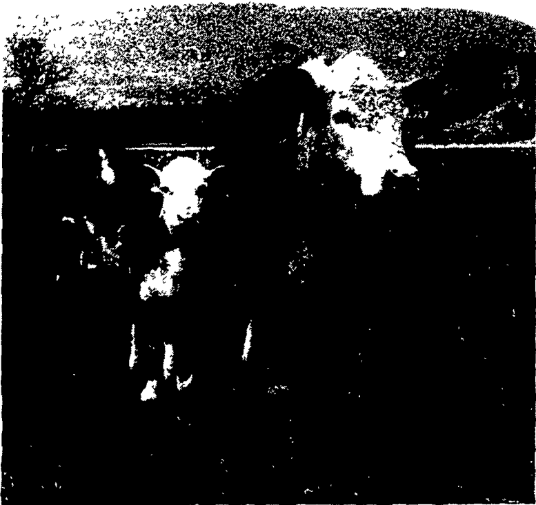
These beef cattle are from the Beef and Sheep Center from Penn State University in Centre County. If you visited KILE this week at the Farm Show Complex in Harrisburg, you saw a lot of animals just like these being judged for quality. If you'd like to have an animal like this visit your school, read how on this page.

Make sure to include your name, address, phone number and your school's name.