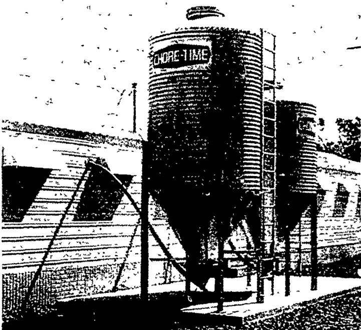
COMPLETELY GALVANIZED BINS

the systems that make hogs SUPER THRIFTY ...SUPER PROFITABLE...SUPER EASY TO RAISE