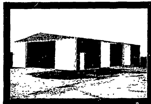
AG MASTER 2:12